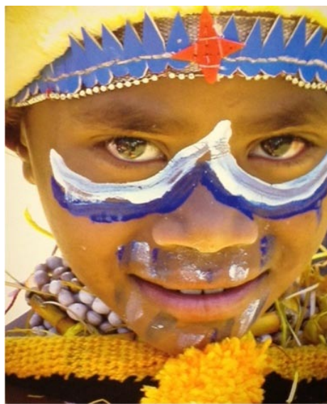
Work from the Healing Seekers

Theatre Art Galleries , High Point Theatre, 220 East Commerce Avenue, High Point. Main