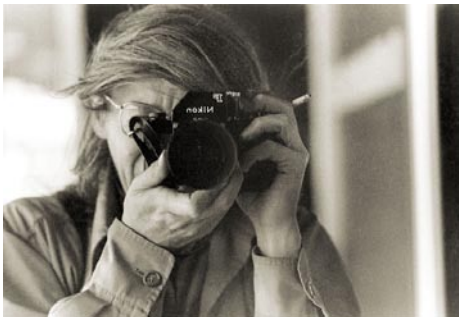
Work by John Menapace

Collective Arts Gallery & Ceramic Supply , 8801 Leadmine Road, Suite 103, Raleigh. Ongoing - Featuring works by local and nationally renowned artists on permanent exhibit. Hours: Tue.-Fri. 11am-7pm & Sat., 10am-6pm. Contact: 919/844-0765.