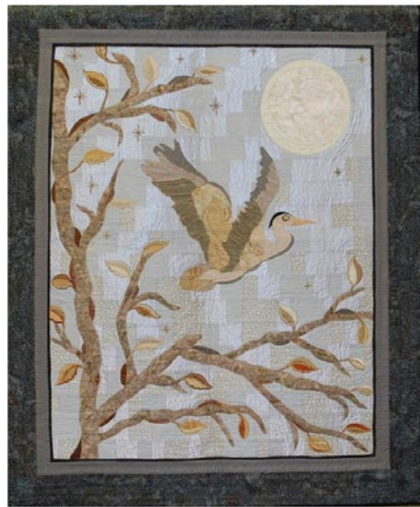
Work by Ron Hodge

Hilton Head Regional Healthcare Gallery , Coastal Discovery Museum, at Honey Horn, off Highway 278, across from Gumtree Road, Hilton Head Island. Through Feb. 8 - "Lowcountry Up Close," featuring works by members of the Camera Club of Hilton Head Island, with a theme of close up views of animals and plants in the Lowcountry. The combination of location and weather make the Lowcountry a place with great diversity in flora and fauna. This exhibit will show the beauty of many small details in nature all around us. The exhibit encompasses either small animals and plants or parts of them that cannot fully be appreciated by the naked eye. Most of the photos featured in the exhibit were taken with the aid of a macro lens, others were taken as close up views with regular lens. The Museum would like to express its apprecia-