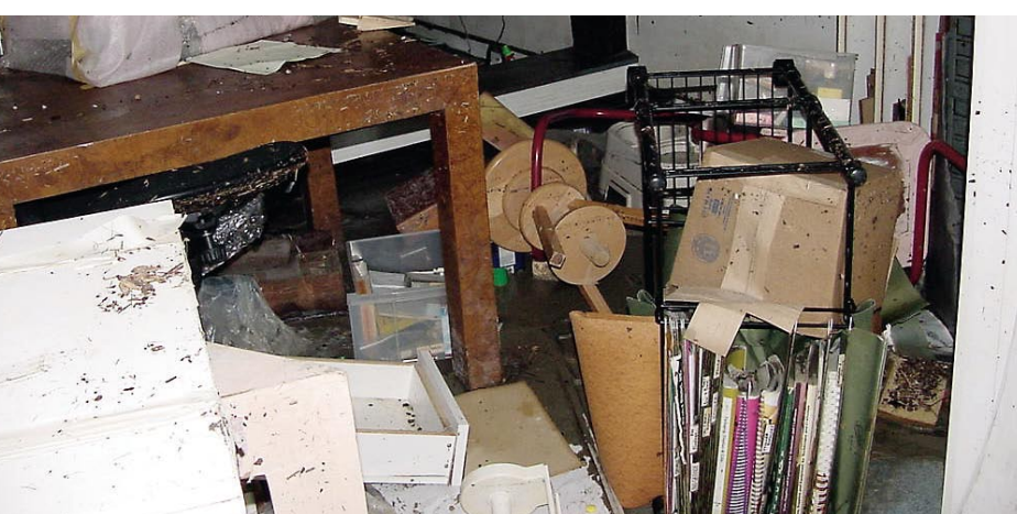
Artist Diane Falkenhagen's Texas studio — destroyed by flooding during Hurricane Ike, 2008

What would you do if you lost your work, your tools, your images, and a lot more to a flood? Metalsmith Diane Falkenhagen knows