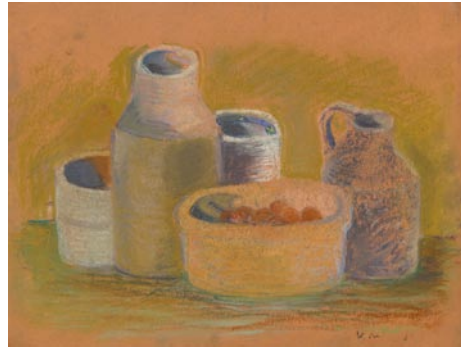
Work by Wolf Kahn

specific landscapes. A highlight is the set of pastels in the style of painter Giorgio Morandi, each titled MORANDI (MIS-UNDERSTOOD) , exploring the role color plays in the simplest still life compositions.