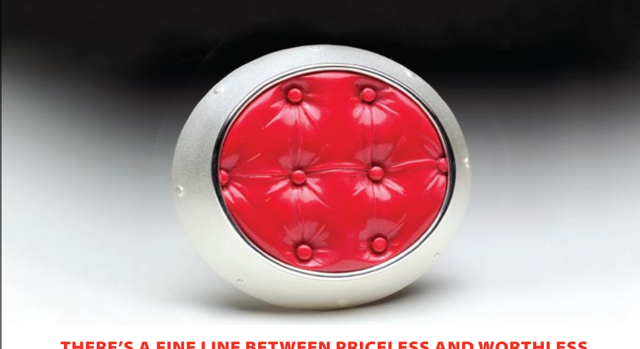
THERE'S A FINE LINE BETWEEN PRICELESS AND WORTHLESS.

The deadline each month to submit articles, photos and ads is the 24th of the month prior to the next issue. This will be Jan. 24th for the February 2016 issue and Feb. 24 for the March 2016 issue.