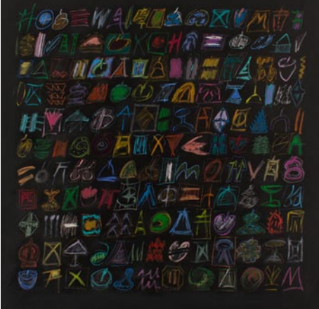
Work by Ida Kohlmeyer

In this exhibition Jerald Melberg Gallery will present a number of paintings, drawings and sculpture from the 1970s through the 1990s. We are especially proud to showcase the 1981 painting DIMINUTIVE SYMBOLS , a newly acquired work composed of a square grid of brightly colored hieroglyphs against a black background.