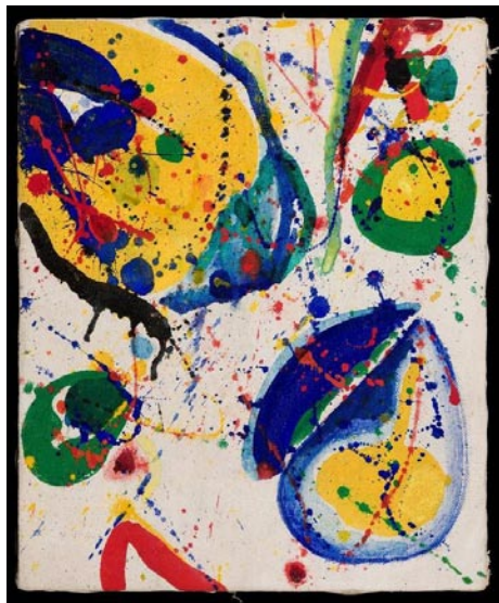
Sam Francis, "As for Appearance II", oil on canvas, 1963-1965

The Folk Art Center in Asheville, NC, is presenting Solid Roots , featuring works by new members of the Southern Highland Craft Guild, on view in the Center's Main Gallery, through Jan. 17, 2016. This biannual show features twenty-two members who have been accepted into the Guild since 2013. Ranging from ceramic sculpture to felted wall-hangings, Solid Roots displays the Guild's tradition and support of fine craftsmanship for 85 years. The Guild currently boasts over 900 artists within its 293 counties (from Maryland to Alabama) of the Southern Highlands. The membership application process, involving two rounds of jury, begins with image submissions, followed by presentation of objects. For further information check our NC Institutional Gallery listings, call the Center at 828/298-7928 or visit ( www.craftguild.org ).