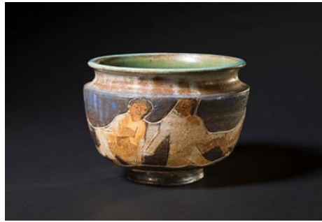
Work by Mayco, Duncan, Amaco Glazes, Slip Bisque, Highwater Clay, Clay Tools