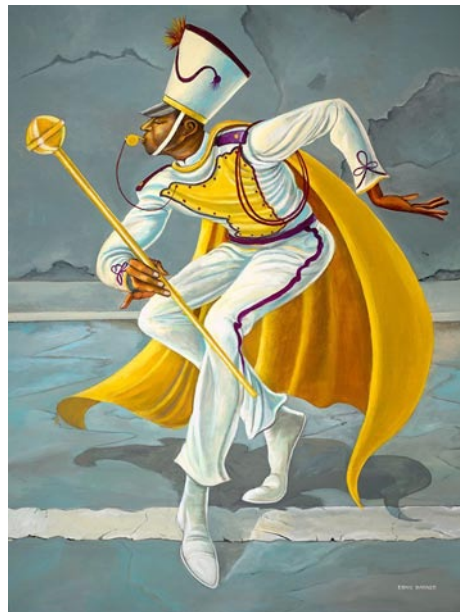
"The Drum Major" (2003). Images courtesy of Ernie Barnes Family Trust©

The North Carolina Pottery Center in Seagrove, NC, is presenting Cast, But Not Least , featuring the slipcasting method, on view through Feb. 23, 2019. Less heralded in the popular imagination than wheel-throwing, slipcasting - the technique of pouring liquid clay, or slip, into molds - has increased in popularity in the last 40 years with studio potters as a method of producing both simple and complex forms. Cast, But Not Least explores the landscape of North Carolina slipcasting, past and present, to show that it is not secondary to turning; the technique presents complex challenges and requires a different way of thinking about and creating ceramics. Featured artists include: Stormie Burns, Herb Cohen, Amanda Crowe, Heather Mae Erickson, Bruce Gholson & Samantha Henneke, Lisa Gluckin, Chris Gryder, Bill Jones, Nick Moen, Tom Spleth, Mark Warren, and Erin Younge. For further information call the Center at 336/873-8430 or visit ( www.ncpotterycenter.org ).