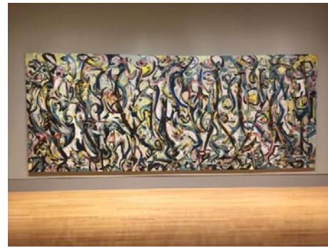
Jackson Pollock's "Mural"

dance, love, sports, education, church, and the South. For further information call the Museum at 919/807-7900 or visit ( www.ncmuseumofhistory.org ).