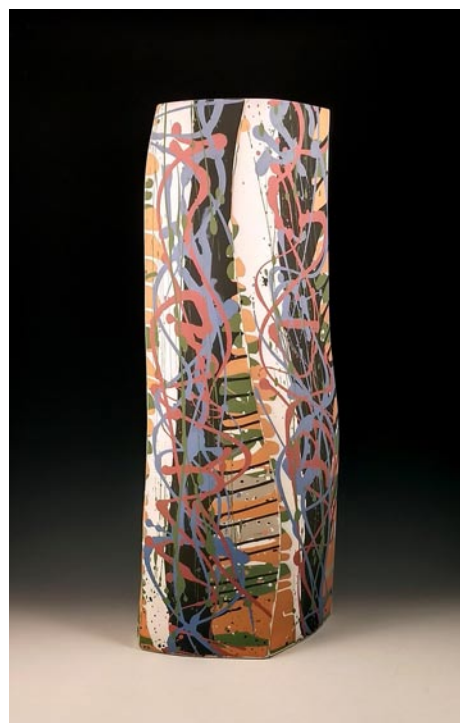
Work by Tom Spleth

The North Carolina Pottery Center in Seagrove, NC, is presenting Cast, But Not Least , featuring the slipcasting method, on view through Feb. 23, 2019. Less heralded in the popular imagination than wheel-throwing, slipcasting - the technique of pouring liquid clay, or slip, into molds - has increased in popularity in the last 40 years with studio potters as a method of producing both simple and complex forms. Cast, But Not Least explores the landscape of North Carolina slipcasting, past and present, to show that it is not secondary to turning; the technique presents complex challenges and requires a different way of thinking about and creating ceramics. Featured artists include: Stormie Burns, Herb Cohen, Amanda Crowe, Heather Mae Erickson, Bruce Gholson & Samantha Henneke, Lisa Gluckin, Chris Gryder, Bill Jones, Nick Moen, Tom Spleth, Mark Warren, and Erin Younge. For further information call the Center at 336/873-8430 or visit ( www.ncpotterycenter.org ).