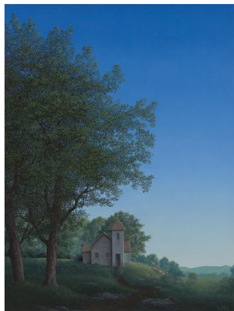
Work by Ward Nichols

The Hickory Museum of Art in Hickory, NC, is presenting works by the Blue Ridge Realists. The works of the ten men who represent this movement will be shown together for the first time beginning Dec. 15, 2012, and continuing until Mar. 10, 2013. An opening reception is planned for Jan. 25, 2013, from 6 - 8pm.