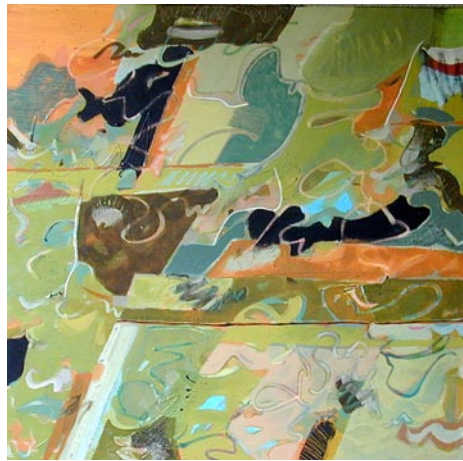
Work by Philip Gott

The Pickens County Museum of Art & History in Pickens, SC, will be presenting three new exhibitions beginning Dec. 1, 2012. Please join us from 6-8pm on Dec. 1, as we host a reception to meet the artist featured in Philip Gott: Explorations in Color ; Crossing the Line: Thirty-One Drawings by Thirty-One Artists , and Writing; Putting Pen to Paper . All three exhibitions will continue through Feb. 7, 2013.