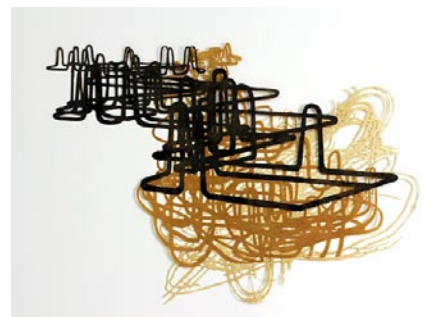
Work by Kathleen Thum

In an artist's statement, Thum describes her work as "a hybrid of various human physiological systems and man-made manufacturing systems." She depicts these systems through rendering abstract networks of forms, lines, and color. Says Thum, "Like our internal anatomy, the structures in my works are layered, linear, flowing, clustered, open, dense, intertwined; interpreting gravity, fluids, gases, and pressures. The complex relationship between the man-made and the natural has become increasingly influential in my art-