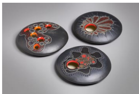
Work by Sasha Bakaric

The show Intersections consists of three artists' unique visions of universal form, and