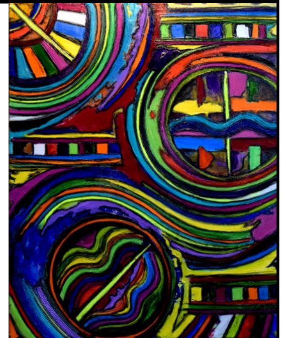
“MOTIONLESS MOMENTUM II”