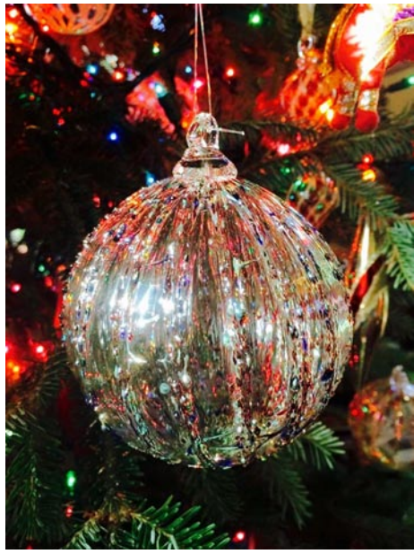
Work by Pringle Teetor

For further information check our NC Commercial Gallery listings, call the gallery at 919/732-5001 or visit ( www.HillsboroughGallery.com ).