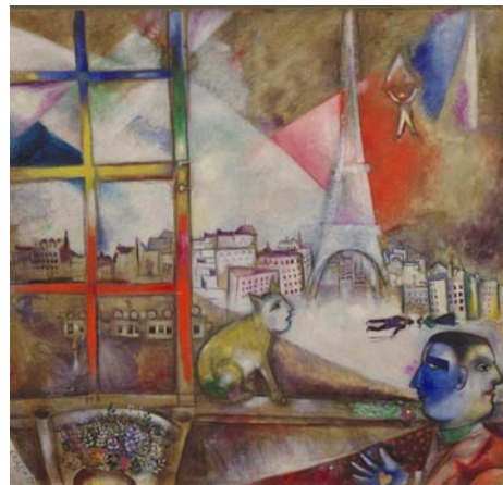
Work by Marc Chagall

Duke University in Durham, NC, is presenting Southern Accent: Seeking the American South in Contemporary Art , on view at the Nasher Museum of Art, Duke University Central Campus, through Jan. 8, 2017. This exhibition questions and explores the complex and contested space of the American South. One needs to look no further than literature, cuisine and music to see evidence of the South's profound influence on American culture, and consequently much of the world. This unprecedented exhibition addresses and complicates the many realities, fantasies and myths that have long captured the public's imagination about the American South. Presenting a wide range of perspectives, from both within and outside of the region, the exhibition creates a composite portrait of southern identity through the work of 60 artists. The art reflects upon and pulls apart the dynamic nature of the South's social, political and cultural landscape. For further information check our NC Institutional Gallery listings, call the Museum at 919/684-5135 or visit ( www.nasher.duke.edu ).