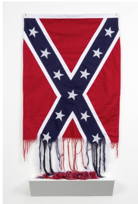
Sonya Clark, "Unraveling", 2015-present. Cotton Confederate battle flag and unraveled threads, edition 2/10; 70 x 36 x 7 inches (177.8 x 91.4 x 17.8 cm). Courtesy of the artist. © Sonya Clark. Photo by Taylor Dabney.

industrial duct work overhead. For further information check our NC Institutional Gallery listings or visit ( www.revolutionmillgreensboro.com/WAMRev ).