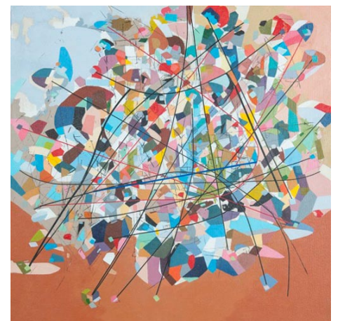
Work by James Williams

The North Carolina Museum of Art in Raleigh, NC, is presenting Rolling Sculpture: Art Deco Cars from the 1930s and '40s , featuring 14 cars and three motorcycles embodying the design characteristics of the art deco movement. The exhibition, guest curated by renowned automotive journalist Ken Gross is on view through Jan. 15, 2017. The art deco period - from the 1920s to 1940s - is known for blending modern decorative arts and industrial design and is today synonymous with luxury and glamour. The cars from this era are no exception. While today manufacturers strive for economy and efficiency, during the art deco period elegance reigned supreme. With bold, sensuous shapes, hand-crafted details, and luxurious finishes, the cars and motorcycles in Rolling Sculpture: Art Deco Cars from the 1930s and '40s provide stunning examples of car design at its peak. For further information check our NC Institutional Gallery listings or visit ( www.ncartmuseum.org ).