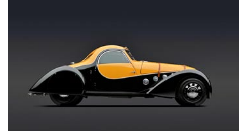
Peugeot 402 Darl'mat, 1936, Jim Patterson/Patterson Collection, Photo © 2016 Michael Furman

tory with the Lowcountry. Charleston is home to many firsts, but it's a little-known fact that the historic city was home to the first formal exhibition of Solomon R. Guggenheim's modern art collection. The exhibition was presented at the Gibbes Art Gallery, the South's oldest art museum building, in 1936 and again in 1938, 21 years before Guggenheim's collection found a permanent home in today's renowned museum designed by Frank Lloyd Wright. For further information check our SC Institutional Gallery listings or visit ( www.gibbesmuseum.org ).