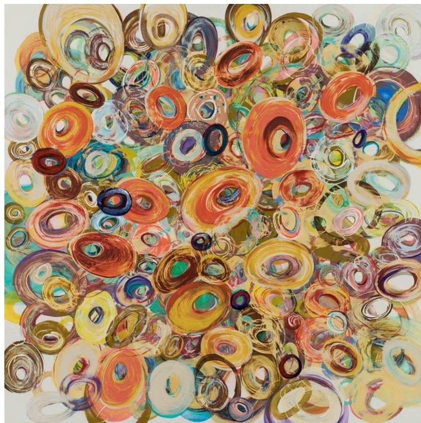
Mock Heroics, 2017 acrylic on panel 30 x 30 inches