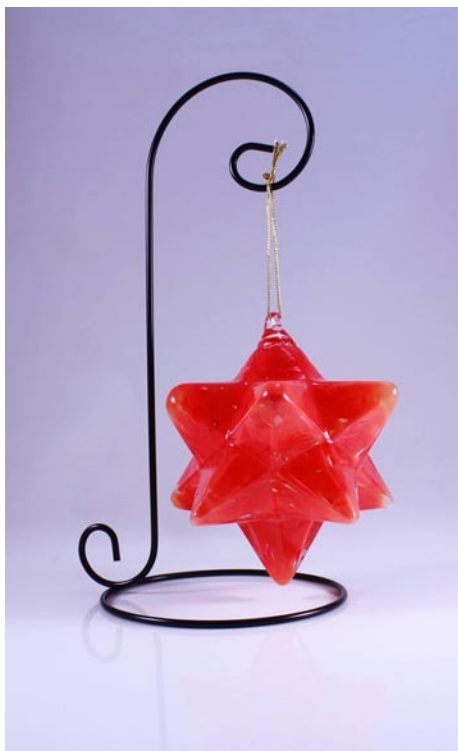
Red Glass Star

There are no advanced or reserved sales. Ornaments left after the sale will be available in the School House Gallery at STARworks, Monday through Saturday, from 9am to 5pm while supplies last. A limited selection of ornaments will be available online at