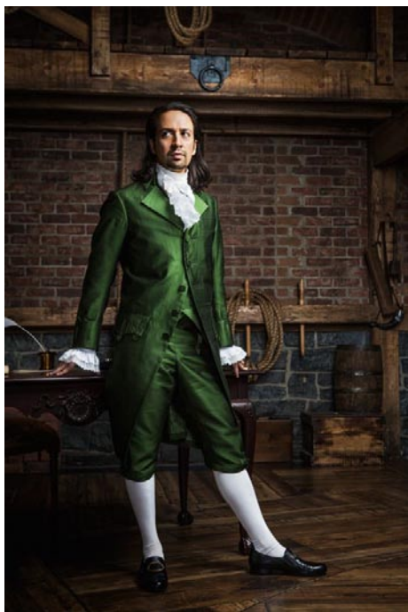
Costume Design by Paul Tazewell

Ola, the Water Bearer was originally created as a "flip book" located under the African Pavilion of the North Carolina Zoo. She has also illustrated the Christmas story, JAIY , incorporating the words of the