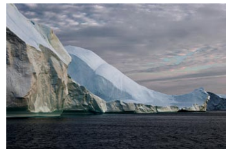
Work by Thomas Pickarski

Central Piedmont Community College is highly accessible and convenient to people of all ages who seek a real-world, affordable, hands-on education that will