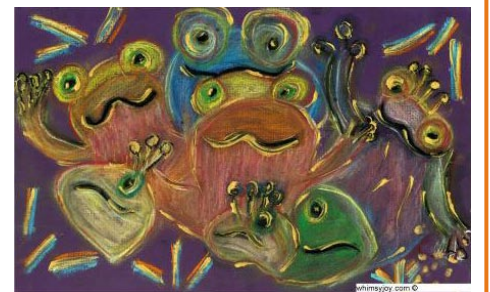
"Family of Frogs -- Healing Families In Color"