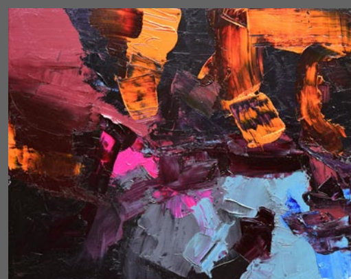
Canna Lily oil 24 x 30 inches