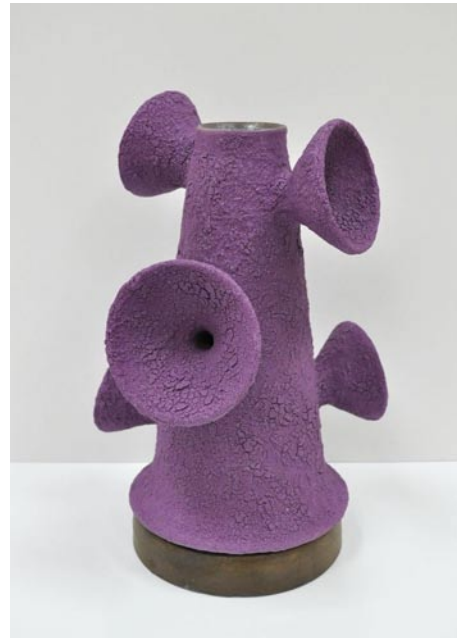
Virginia Scotchie, "Object Maker Series", 2020, glazed stoneware. Asheville Art Museum. © Virginia Scotchie.