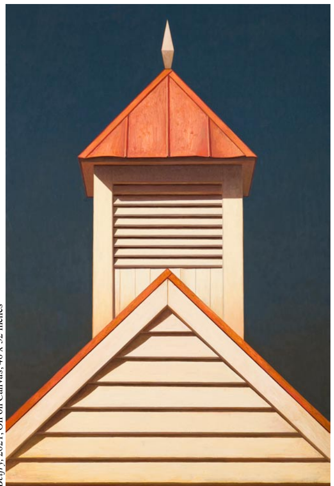
Belfry, 2021, Oil on Canvas, 48 x 32 inches