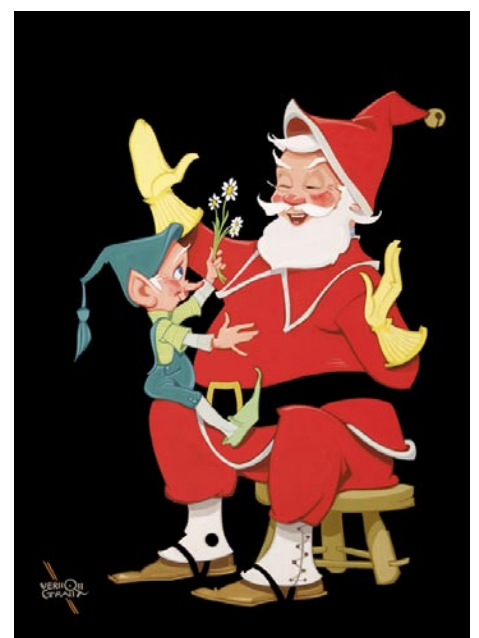
"Flowers for Santa" by Vernon Grant. Copyright ©1966 & 2005. Courtesy of the Culture & Heritage Museums

Only at the Center for the Arts during ChristmasVille in Old Town Rock Hill, visitors can see the Chairman's Choice Santas and previous People's Choice winners. Vote for your favorite Chairman's Choice while you are at the Center for the Arts! Visit ( ChristmasVilleRockHill.com ) for complete details.