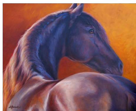
Work by Holly Glasscock

"The farm used to be a dairy farm and now I operate it as a pine and horse farm," adds Glasscock. "My intent in my art is to make visible that which might possibly go unnoticed - how the light hits the grasses at dawn, the skeletal shapes of winter trees or the subtle colors of a black horse's coat in the light. These representational works are a combination of plein air and studio works done in oil, acrylic and pastel that reflect the country life. The compositions are mainly of organic substance with man-made geometric objects limited to a rural or rustic nature. This body of