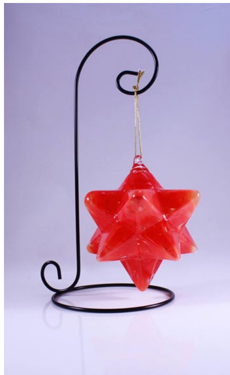
Red Star Ornament

STARworks Center for Creative Enterprise , 100 Russell Drive, just seven miles south of Seagrove in Star. STARworks is a project of Central Park NC, a 501-(c)(3) not for profit organization based in rural central North Carolina. The mission of CPNC is to grow a new rural economy based on the sustainable use of the natural and cultural resources of the region. Dec. 4 - 18 - "STARworks Holiday Ornament Sale". Thousands of handblown glass ornaments in a variety of shapes and colors will be available at the STARworks Holiday Ornament Sale. Online sales begin Dec. 6 at ( www.STARworksNC.org ). Ornaments and other holiday themed glass decorations are handcrafted by STARworks artists, interns and resident artists. In addition to the familiar ball ornaments, STARworks glassblowers have brought back the popular star ornaments, candy canes, icicles, birds and pendant ornaments for this holiday season. There will also be a large variety of angel, snowman and tree sculptures. STARworks Businesses: STARworks Glass is a public access glass studio that offers rental space for glass artists, classes and workshops for the general public, a resident artist and internship program, and high school and college glass curriculum. In addition to fundraisers