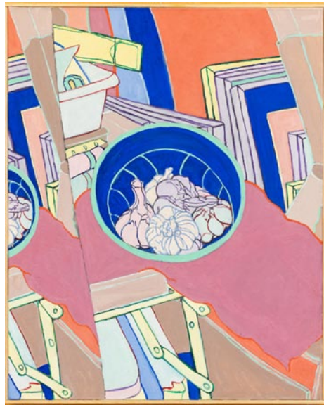
Work by Ellen Lee Klein

The artist's fealty to, mastery of and her continued fascination with color resonance, line and ambiguous space are employed unselfconsciously to describe her view of contemporary life seen through an artist's eyes using mundane objects collected, assembled and observed over time. These become her muses.