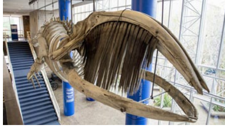
North Atlantic right whale skeleton in the Museum lobby.