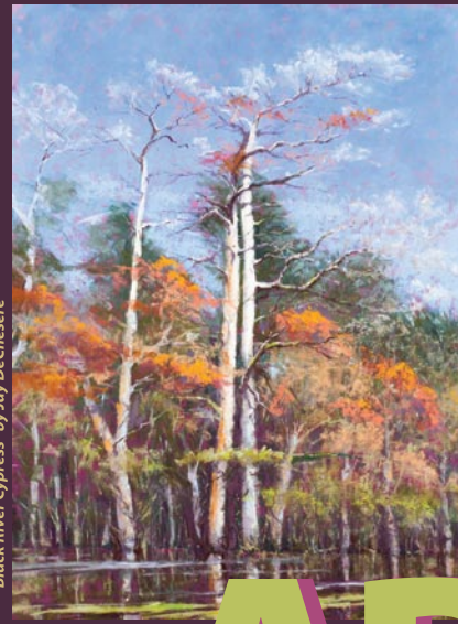
"Black River Cypress" by Jay DeChesere