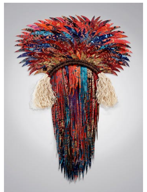
Work by Deborah Kruger

The City of Raleigh, NC, is presenting TURBULENCE: Birds, Beauty, Language & Loss , a solo exhibition on view at the