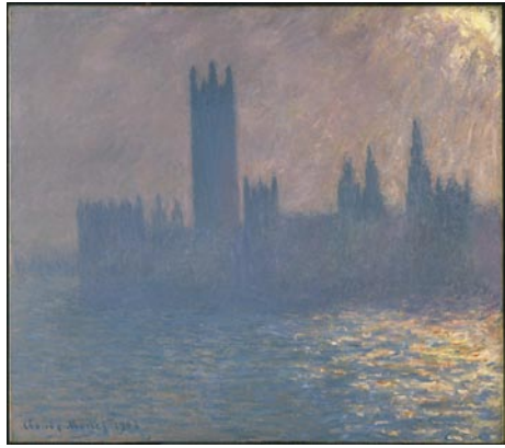
Claude Monet (French, 1840-1926) "House of Parliament"