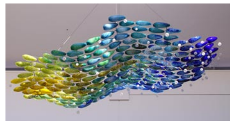
Installation of work by One Eared Cow Glass at Columbia Convention Center