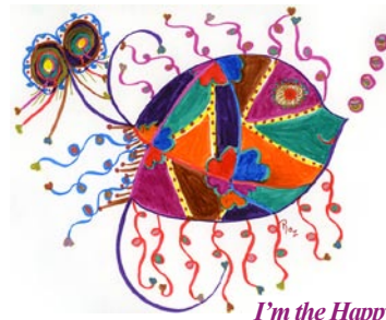
I'm the Happy One!

Prints • Notecards • T Shirts • Decals Aprons • Stickers • Calendar • Mousepads Children's Paint Smocks