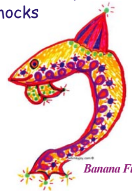
Banana Fish Clown

Check my website for new whimsies! All images are copyrighted