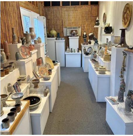
View inside Bulldog Pottery's shop.

Blue Stone Pottery, 2215 Fork Creek Mill Rd., Seagrove. Ongoing - Featuring traditional, functional stoneware pottery. Hours: Tue.-Fri., 10am-4pm & Sat., 9am-5pm. Contact: 336/879-2615 or e-mail at (audreyvalone@bellsouth. net).