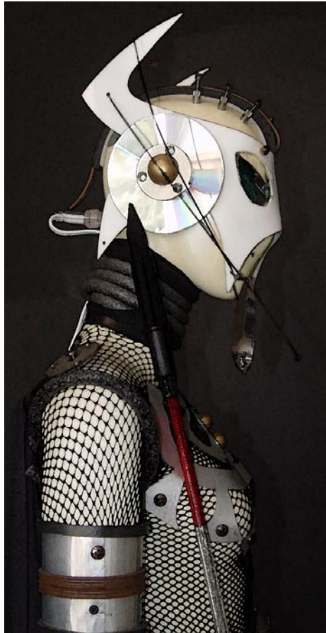
Work by David Cianni

701 Center for Contemporary Art in Columbia, SC, is proud to present Faster Forward , an exhibition highlighting the work of 10 artists from Israel, Canada, Spain, United Kingdom and the United States whose new media, experimental film and video works explore contemporary visual culture mediated through popular technologies. The exhibition will be on view through Mar. 4, 2012.