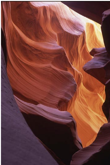
Work by John Byrum

"I always approach my craft with an open mind and try to be ready for those times that I witness a scene that just stops me in my tracks and I can totally feel it and picture exactly what it would look like in a two-dimensional photo," said Byrum. "When that spirit moves me, I like to think that others will appreciate what I'm seeing."