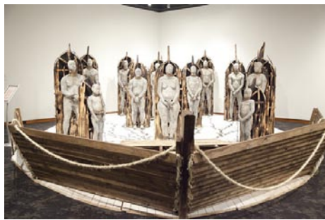
Works by Stephen Hayes

At the core of Cash Crop are 15 life-size sculptures of shackled people placed in boat- or coffin-like structures, with diagrams of captive, warehoused humans in Trans-Atlantic slave ships carved in wood on the back. The sculptures represent, Hayes says, "the 15 million human beings kidnapped and transported by sea during the Trans-Atlantic slave trade." Through these works and others in the exhibition, Durham, NC, native Hayes invites the viewer into an emotional, physical and psychological space to confront past, present and future.