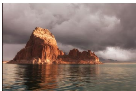
Work by Ulla Schaefer

Images of untouched landscapes as well as selected details have always been central to Schaefer's photography. Her German background and the country's dense population led her to appreciate the vastness of American nature. Coming from B&W photography, many of her photographs are either completely devoid of colors or the colors are often subdued. The adjustments in the landscapes are subtle to keep the natural appearance - different from the pictures of rundown