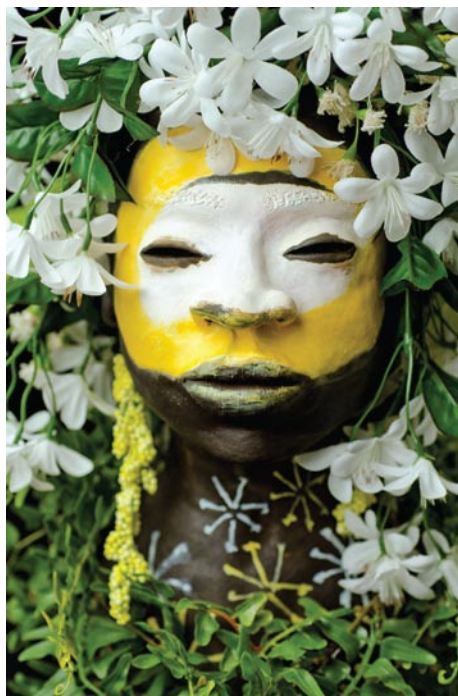
Work by Bailie

with a cause.” He was inspired by other tribal imitations and decided to create his own, thereby stumbling upon the issue of construction along the Omo River in Ethiopia. Omo tribes are suffering throughout the valley as a large hydro-electric dam is threatening to be built upon the Omo River. This dam would only worsen the problematic dry lifestyle of the Omo tribes; however countries, such as China, are pushing to continue construction. This exhibit serves to