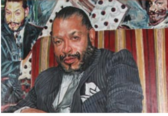
THROUGH - FEB 16, 2013 TARLETON BLACKWELL: The Hog Series