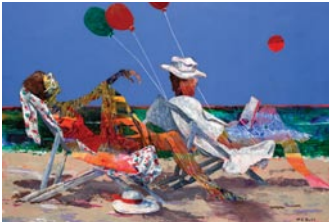
THROUGH - FEB 16, 2013 Mary Ellen Suitt: In Retrospect