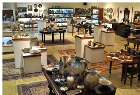
View inside Pottery Road Studio

Pottery Road Studio & Gallery is fairly new to Seagrove, but Don and Susan Walton, the potters who run the gallery are not newcomers by any means. The shop is located at 1387 Highway 705 South, the same location that housed Walton's Pottery for many years before the Waltons took some time away from pottery to focus on another creative business, Rubber Stamp Tapestry. Pottery Road Studio is now home to both Walton's Pottery and Rubber Stamp Tapestry, and also features functional and contemporary pottery created by other artists.