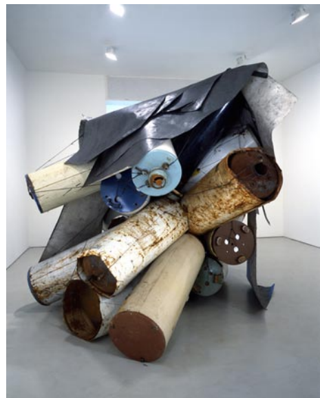
Nancy Rubins, Drawings & Hot Water Heaters , 1992, hot water heaters, black tie-wire cable, and graphite pencil on paper, approx. 18 x 11 x 10 ft. Collection of Martin Z. Marguiles, Miami.

For further information check our NC Institutional Gallery listings, call the Museum at 336/334-5770 or visit ( http://weatherspoon.uncg.edu/ ).