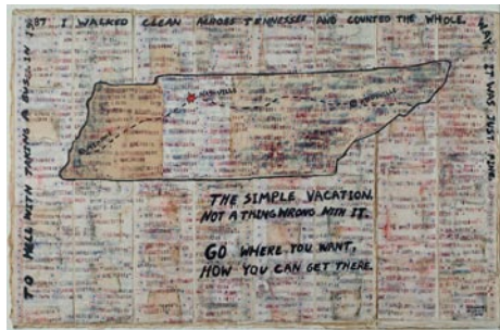
George Widener, Nashville, TN Map , 2010, mixed media on paper, 19.5 x 30 inches. Collection of Sara Kay, NY.

For further information check our NC Institutional Gallery listings, call 828/253-