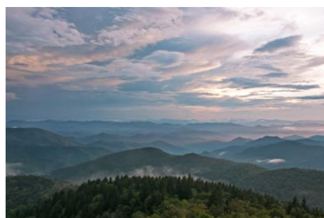
Work by Bonnie Cooper

The images exhibited have a heavy emphasis on nature with a selection of landscapes and portraits of flowers and trees. In keeping with the theme of "Images that Endure" there's also nostalgic photographs including a series of rustic cars. Today's photographers have a wide choice of materials on which to offer their images to customers. The images on display include those on photographic paper framed under glass, canvas and metal.