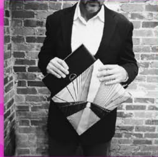
metro sax for him $26.