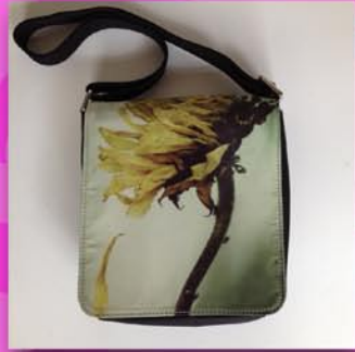
iPad sling bags & purses $45-$85