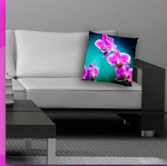
couch candy cushion covers $35