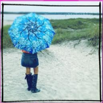
funbrella dogwood umbrella $35