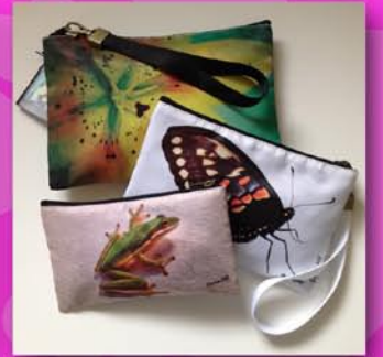
haute sax wet/dry bags $12-$18