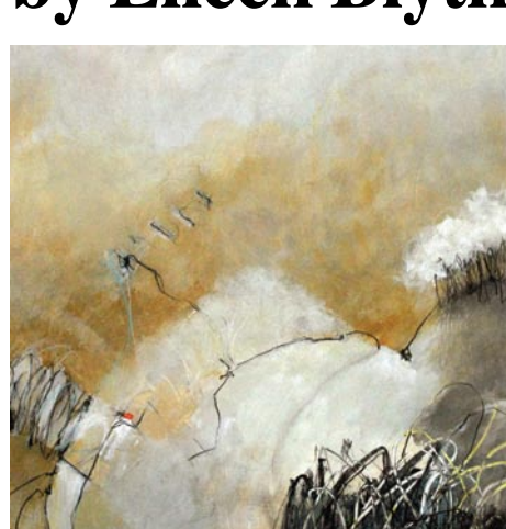
Work by Eileen Blyth

According to Glaser, no artist should stop exploring and discovering new prospects. Just because an artist has landed on something that resonates – that sells or is widely celebrated at one moment in time – does not