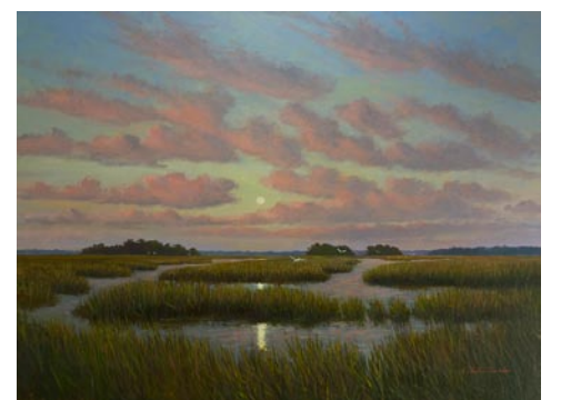
Moonrise Over Cumbahee Rice Fields 36" x 48" O/C