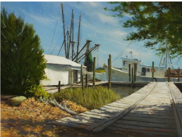
Valona Seafood II 18" x 24" O/C