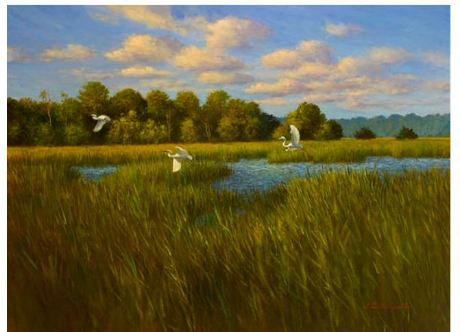
Summer Marsh 30" x 40" O/C