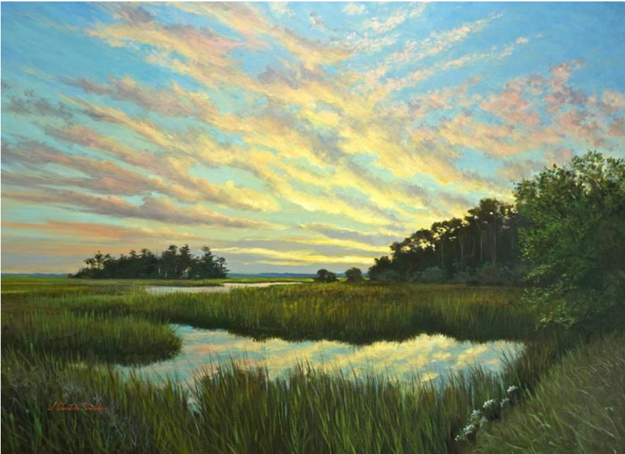
Rockville Sunset 36" x 48" O/C