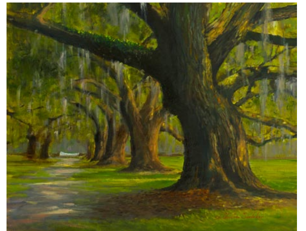
Run Forrest, Run 16" x 20" O/C