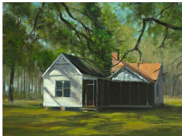
Donnelly Summer 18" x 24" O/C