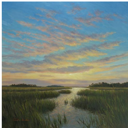
Evening Splendor 30" x 30" O/C