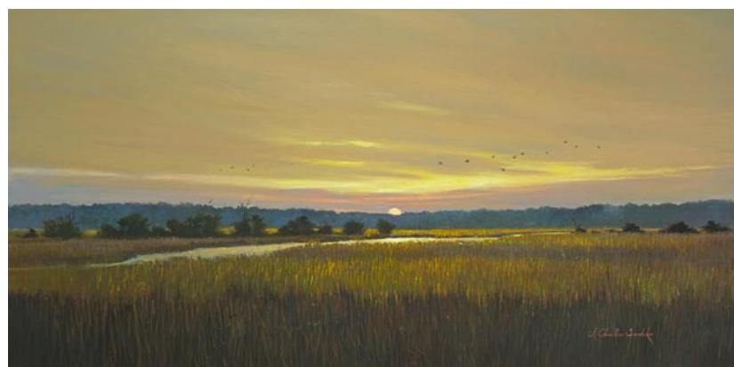
Stono Sunset 24" x 48" O/C