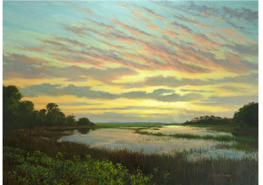
Flood Tide 36" x 48" O/C