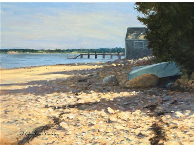
Pleasant Bay 12" x 16" O/C