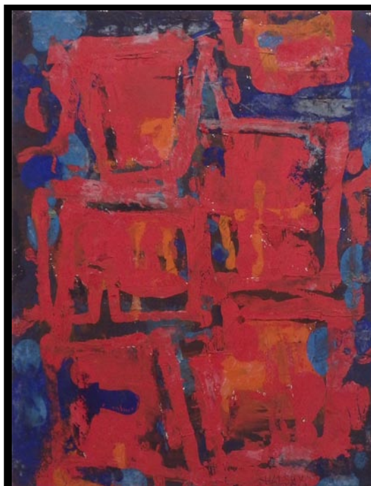
Duo by William Halsey, oil on paper, 11 x 15 inches