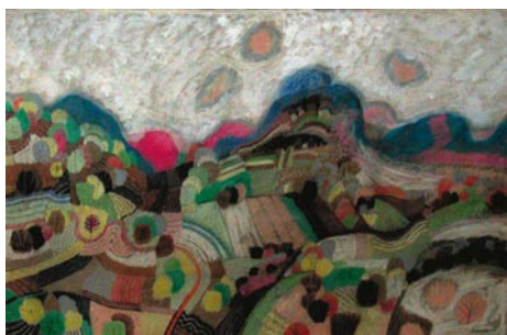
Work by Carl Blair

For further information check our SC Institutional Gallery listings, call the Museum at 843/238-2510 or visit ( www.MyrtleBeachArtMuseum.org ).