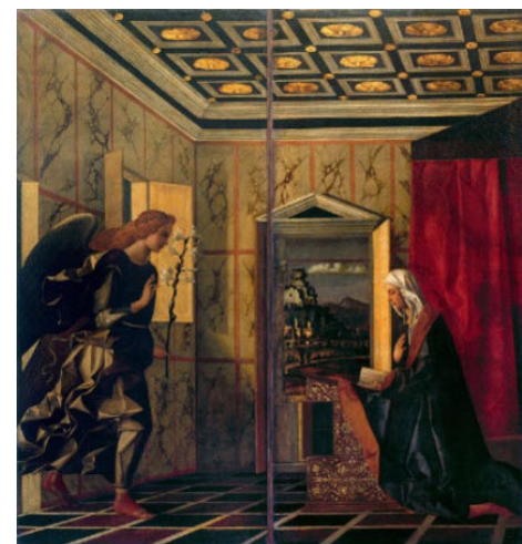
Giovanni Bellini, "The Annunciation", early 1500s, oil on canvas, 88 x 42 in. each, Gallerie dell'Accademia, Venice, Italy

Collective Arts Gallery & Ceramic Supply , 8801 Leadmine Road, Suite 103, Raleigh. Ongoing - Featuring works by local and nationally renowned artists on permanent exhibit. Hours: Tue.-Fri. 11am-7pm & Sat., 10am-6pm. Contact: 919/844-0765.