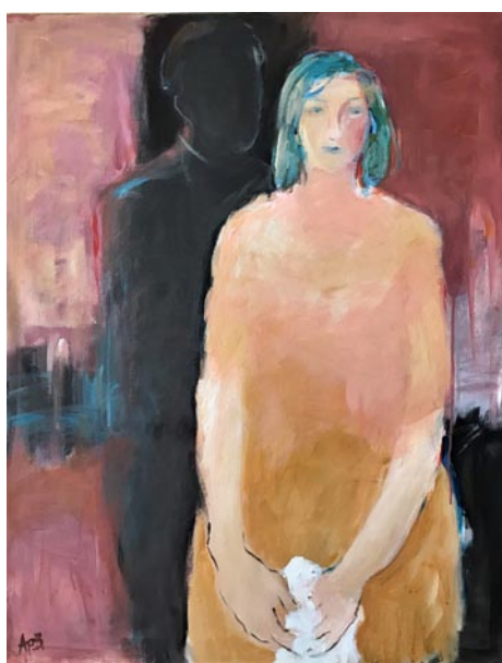
Work by Agnes Preston-Brame

Thirty photographs of High Point landmarks are included in the exhibit. The