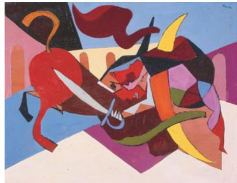
(Bearden - "At Five in the Afternoon" copy) Romare Bearden (American, 1911-88). "At Five in the Afternoon", 1946, oil on composition board. Fred Jones Jr. Museum of Art, The University of Oklahoma, Norman; Purchase, U.S. State Department Collection, 1948. © 2022 Romare Bearden Foundation / Licensed by VAGA at Artists Rights Society (ARS), NY

While various aspects of Bearden's engagement with Picasso and Cubism have been occasionally explored, this is the first museum exhibition organized to explore the parallels between the artists. The works in the exhibition are drawn from the Mint's deep holdings of Bearden's art, as well as from both private and museum collections.