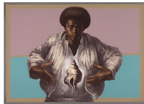
Charles White [1918-1979], "Sound of Silence", 1978, lithograph, Private collection.

It is worth noting several works in this collection were included in Charles White: A Retrospective , which traveled from the Art Institute of Chicago, to MoMA, to the Los Angeles County Museum of Art. The itinerary of this widely acclaimed 2018 tour