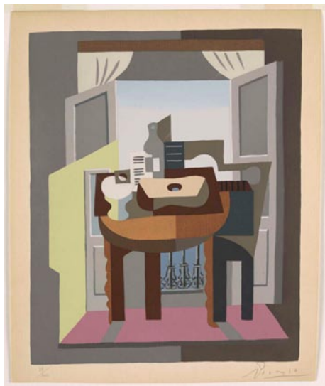
Pablo Picasso (Spanish, 1881-1973). "Nature morte devant une fenêtre ouverte sur l'eau", circa 1923, gouache on silkscreen on paper. Musée Picasso, donation Pablo Picasso, 1979, MP3505. © 2022 Estate of Pablo Picasso / Artists Rights Society (ARS), New York

Bearden was an ardent scholar of art history who saw many examples of Picasso's work in New York in the 1940s. Bearden wrote about various aspects of Picasso's work during that time and also met Picasso in Paris in the 1950s. The influence of Cubism, and of Picasso's work in particular, can be seen across Bearden's career, from his early oils and watercolors of the 1940s in which his subjects are presented in abstracted planes of color. In the 1950s, Bearden's experimentations with pure abstraction and Cubism can be seen at play. Bearden's