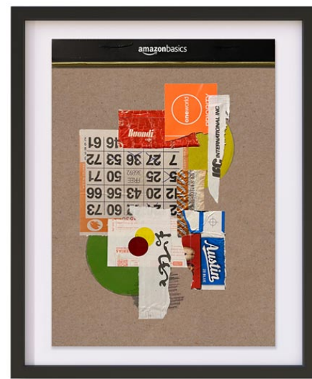
Work by Elliot Strunk

Please visit Footnote Coffee and Cocktails for this unique opportunity to experience Elliot's collage work in person.