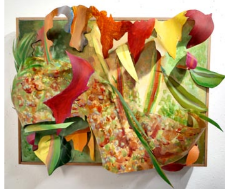
Work by Lea Lackey-Zachmann

For further information check our NC Institutional Gallery listings, call the gallery at 336/723-5890 or visit ( www.Artworks-Gallery.org ).