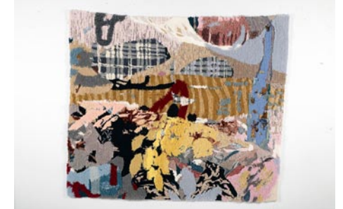
Work by Randi Reiss-McCormack