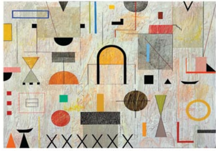
Work by Tom Stanley

works of art for your viewing and purchasing pleasure. View abstraction to realism, pottery, jewelry, sculpture, photography, digital illustration, limited edition prints and so much more. Hours: Mon.-Fri., 9am-5pm & Sat., 10am-5pm. Contact: 704/940-8090 or at ( charlottefineart.com ).