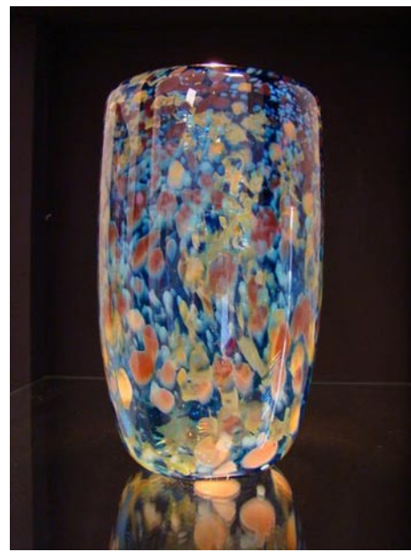
Work by Conway Glass

Conway Glass Center , 708 12th Ave., historic Creel Oil building Conway. Ongoing - Featuring an open-air gallery and glass educational