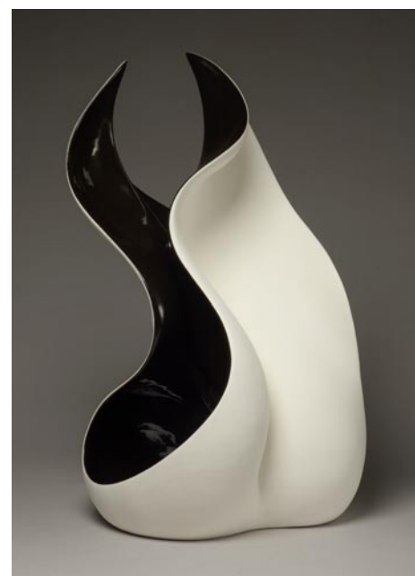
Work by Holly Fischer

For all their differences, their shared vision is "Flow". Ibrahim's paintings are graceful and fluent, a combination of intuitive fluidity and disciplined control. Fischer's provocative abstractions are smooth and rich, giving voice to feminin-