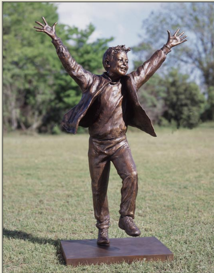
Glenna Goodacre The Winner Lifesize Bronze