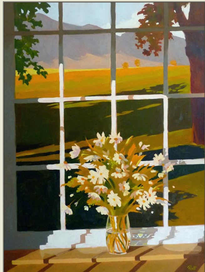
Rhett Thurman Wyoming Window Oil 30 x 40 inches