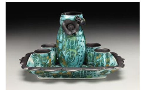
Works by Angelique Tassistro

Options, Inc. is a small non-profit advocacy center that provides empowerment services and emergency shelter to Burke County families in crisis. We support victims of domestic and sexual violence as they become empowered to make life decisions and break the cycles of abuse and economic dependence. Options was founded as a volunteer agency and began assisting battered women and children in 1978. Initially, Options provided rape and sexual assault advocacy, hospital accompaniment, and court advocacy for victims of violent crime. Options opened the Cliffhaven Shelter for battered women in 1990, and in 2002 expanded to a new facility.