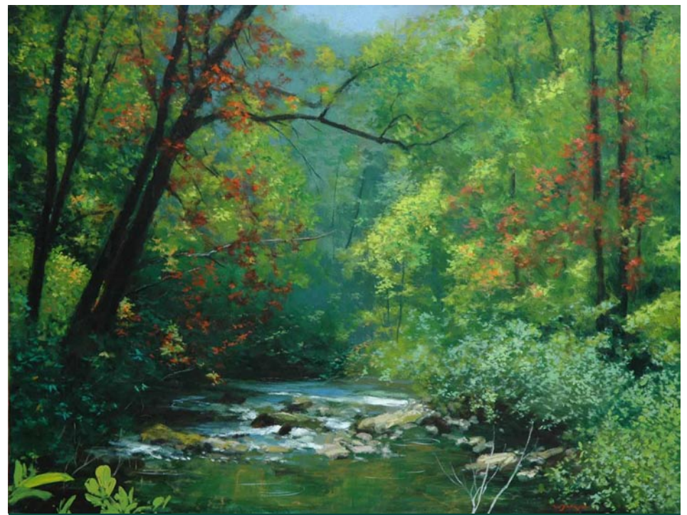
Late Summer on the Chattooga River

For more info check our SC Institutional Gallery listings, call the Museum at 864/582-7616 or visit ( www.spartanburgartmuseum.org ).